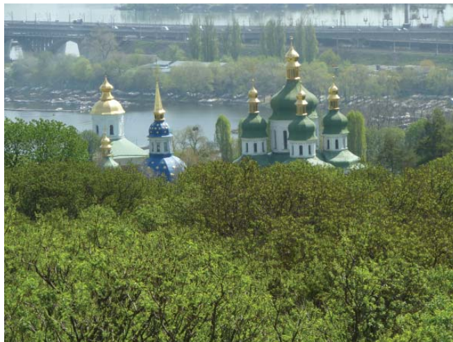
Monasteries, churches and R. Driper.

The beautifully-colored and magnificent structures of Kiev's Orthodox churches and monasteries with their onion-shaped crowns and domes are a distinctive feature of Kiev and well worth a visit. Kiev is also a city of many parks, botanic gardens, a zoological garden, well laid out university campuses, tree-lined streets and museums of culture, archaeology, and science and technology. It is divided by the wide River Dnieper with its deep sandy banks which is as busy in the Summer months as any seaside resort. It also has an extensive network of trams, buses and underground stations – the latter being the