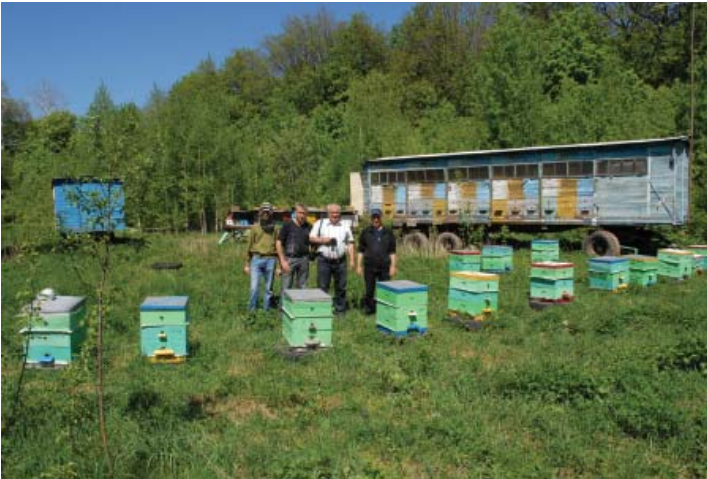
Modern hives and a mobile bee house.

deepest in the world - all of which makes getting round the city both cheap and easy.