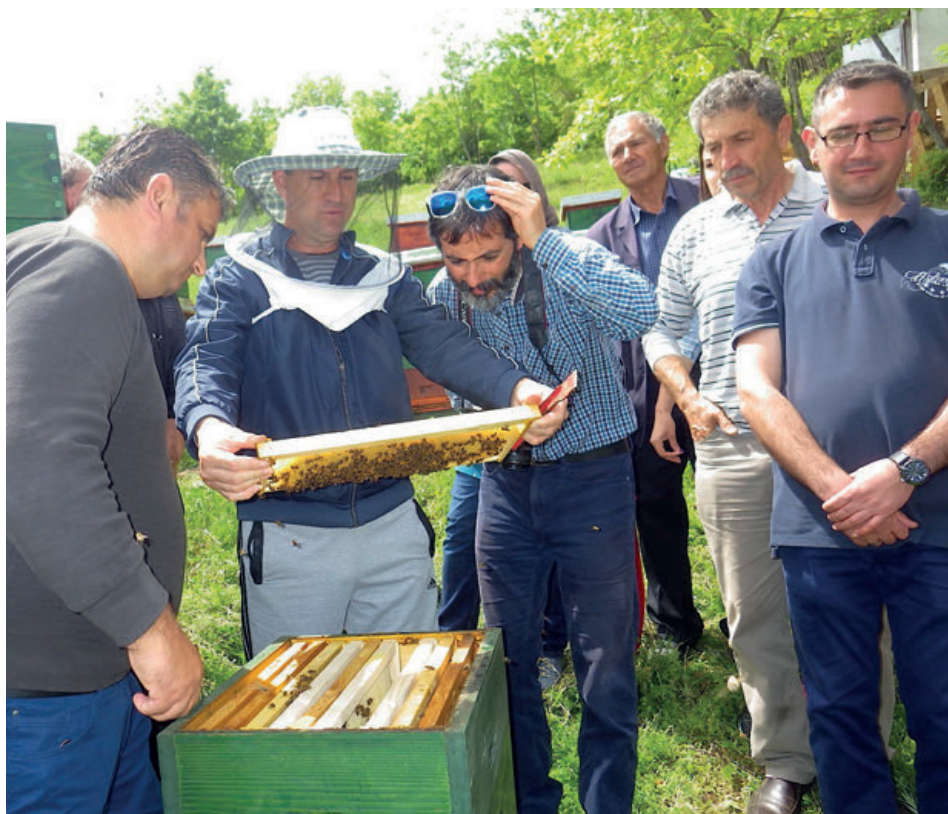
Characteristic of all the bees we saw in Macedonia was their great docility and patience. Nobody was stung despite the incursions into the bees' domain and the many strangers around the hives.

and the stems of wild clematis, which is abundant everywhere, and are coated with cow dung. The bees seem to like them and they are inexpensive to make, if somewhat time-consuming.