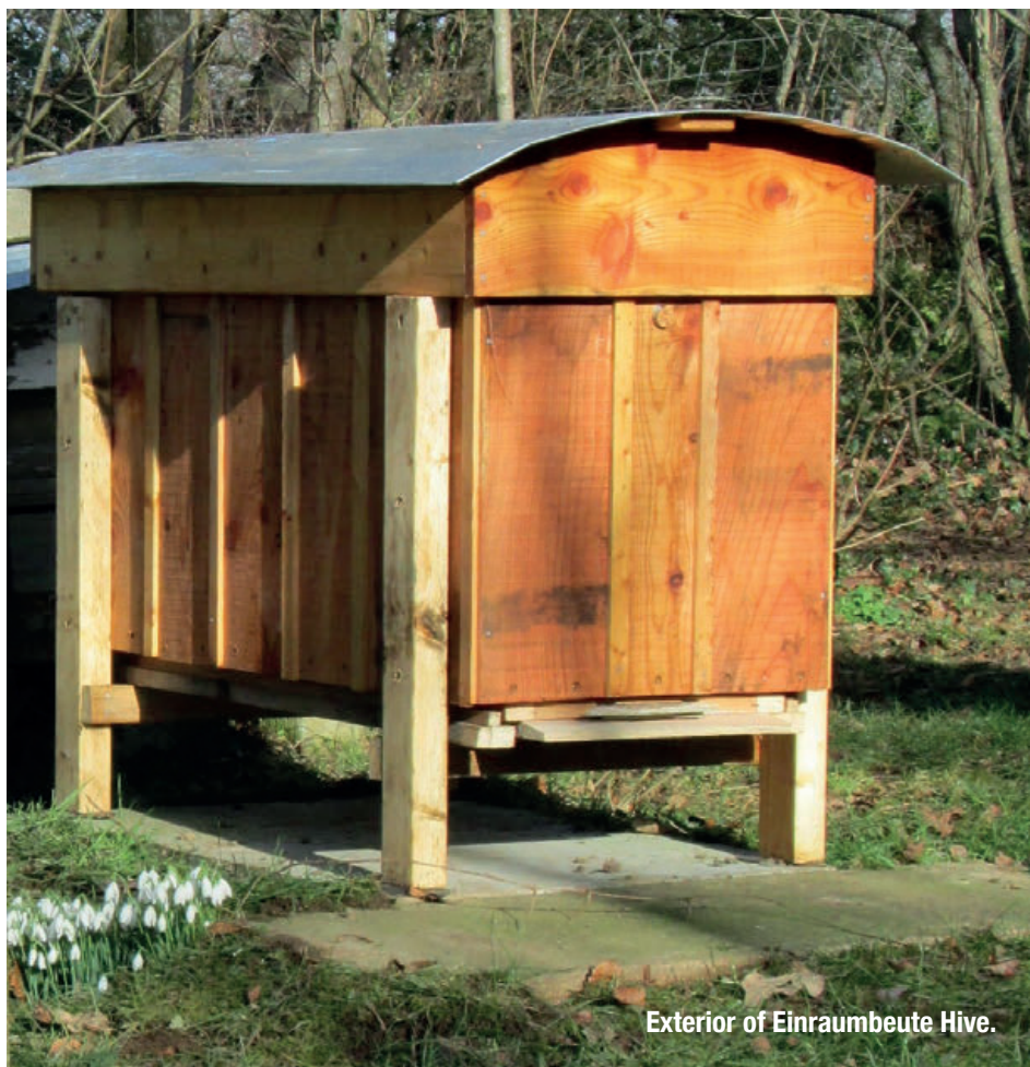
Exterior of Einraumbeste Hive.

The relatively recent trend towards naturalness in beekeeping is far from being a romantic hankering after traditional, older methods. Rather is it not only a post-modern reaction to the modernism of industrialised apiculture but also it has found its evidence-based justification in existing knowledge of the life history of the honey bee including the most up to date findings of apiological science. Furthermore, although it is true that natural beekeeping has its greatest following among hobby beekeepers, it is not devoid of those who produce honey for sale. For example, one