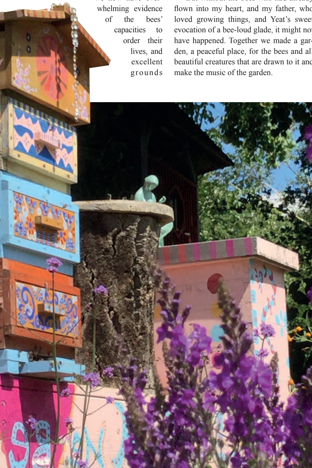
Plants were chosen to give bees all year round forage.