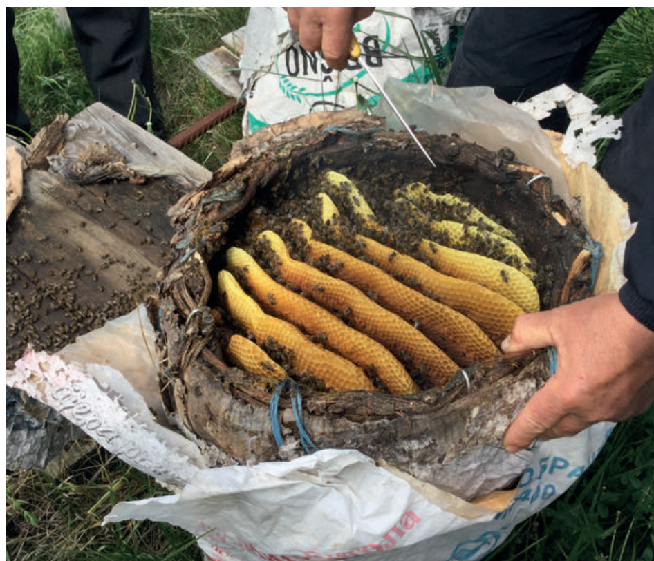
Above: Traditional Macedonian 'Trmka' skep. Old paper feed bags provide additional weather protection. Note the dark local bees, Apis mellifera macedonica .

The Republic of Macedonia is a small country to the north of Greece. For historical reasons, and somewhat confusingly, the north of Greece itself is also called Macedonia but that Macedonia is very flat and