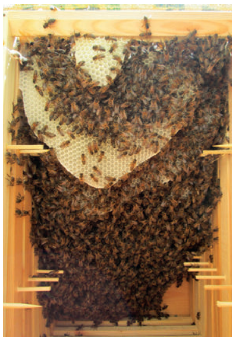
Interior of Einraumbeute hive to show partly completed combs with pegs to help support them

It would be beyond the scope of this article to enlarge on all these aspects, so we will select a few of the more fundamental ones. Among apicentric beekeepers are various degrees of adherence to what is natural for the bees, probably the most apicentric being cutting a cavity in a living tree and baiting it with wild comb to attract a swarm to set up home in it (Zeidlererei). But regardless of one’s outlook on the living world in general and honey bees in particular, there is one factor that should unite all beekeepers and that is their concern for bee health. Even the bee farmer wants healthy bees, otherwise it could affect his bottom line. So I will focus the remainder of this article on a few of the reasons why natural beekeeping can help with bee health.