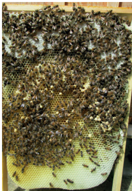
Interior of Einraumbeute hive to show a completed naturally-built comb.

Purchased queens are rarely from the same locality as the one in which they are used and are thus not locally adapted strains that give better colony survival. There was a great wisdom in the tradition of landraces in farming, i.e. breeds adapted to their locality. Recognition of the value of local adaptation partly motivates efforts to conserve the European black bee, 3u. A.m. mellifera , in its original habitats. The race evolved to cope with the climate and forage of the region with-