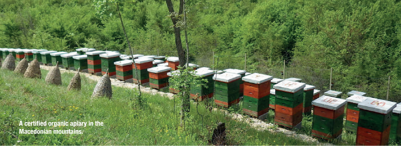
A certified organic apiary in the Macedonian mountains.