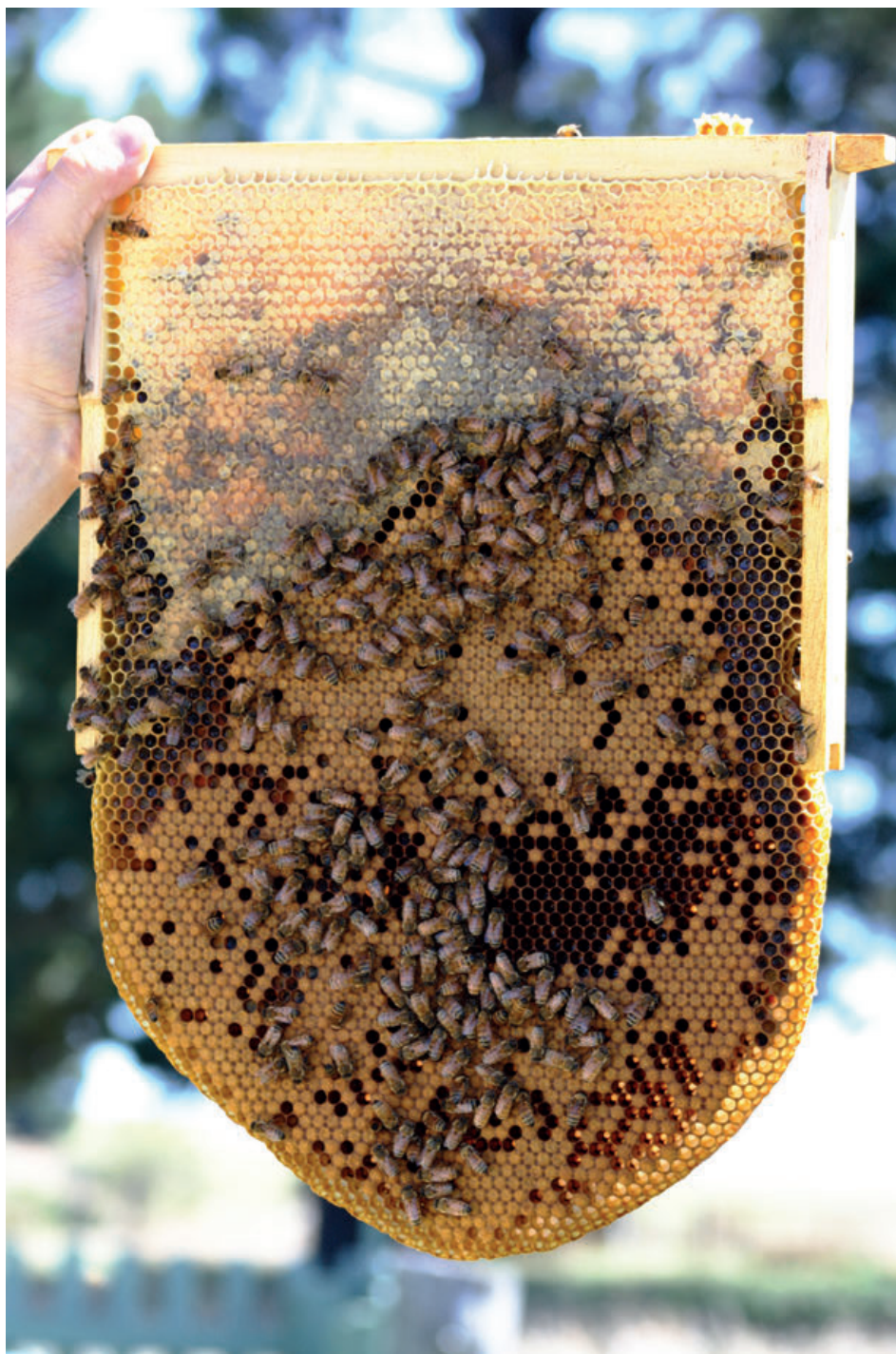
Deep hanging comb in a 3-sided frame, Central Tablelands, NSW 2011

On my return, I began preparing my own Warré apiary. I populated the first Warré hive with a large 'shook swarm' and on a late summer honeyflow of Red Stringybark ( Eucalyptus macrorhyncha ) the bees filled an astounding four boxes of comb in a matter of weeks, then wintered beautifully and have continued to thrive ever since. The colony not only built a prodigious amount of comb that season, they also behaved differently, were