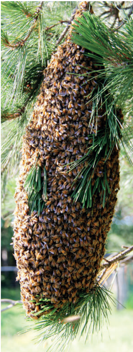
A good swarm.

On reflection, some of the positive outcomes of the Warré hive and method were clear to me almost immediately while others took years for me to fully appreciate. I've listed just a few of these below.