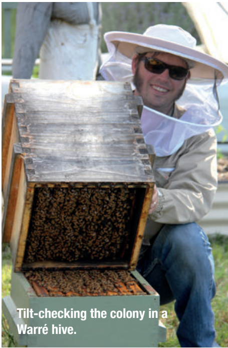
Tilt-checking the colony in a Warré hive.