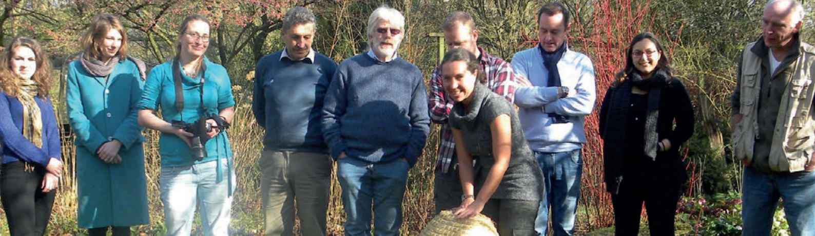
Our initial meeting in Holland.