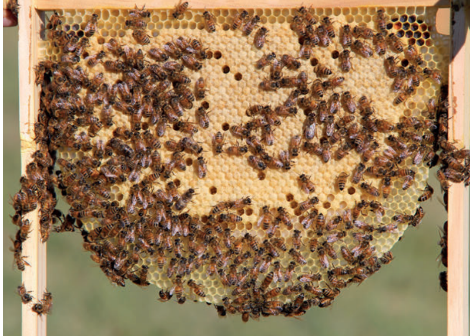
Comb in three-sided frame partially completed.

We are fortunate to be located in an area with a diverse climate, encompassing sub-tropical and cool temperate zones.