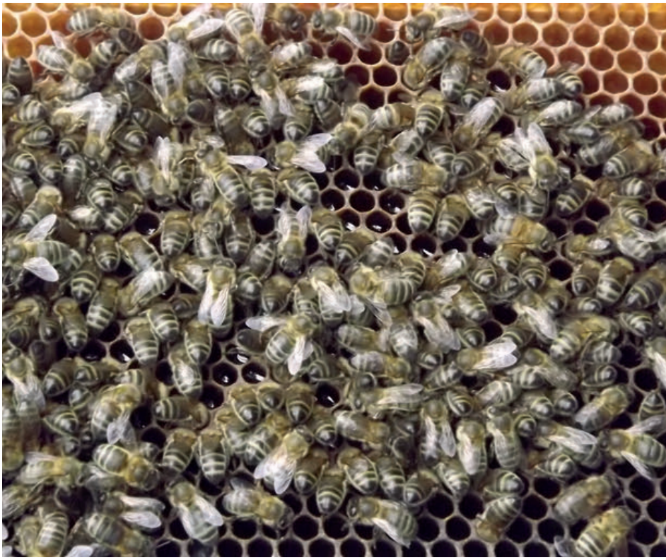
The author's Northumberland strain of Apis mellifera mellifera .

( p < 0.001 ) longer than those with non-local queens. I have selected and bred from local bees for nearly 40 years now, with a view to strengthening representation of the local variant of the North European Dark Bee, Apis mellifera mellifera L. in my area of Northumberland. In the survey it was not necessarily the mellifera subspecies that was most successful, but only so where A. m. m. was native to that locality. The important point is that independent survival of honey bees everywhere against this new pathogen turned out to be highest in stocks that were already naturally selected to dwell at that specific location.