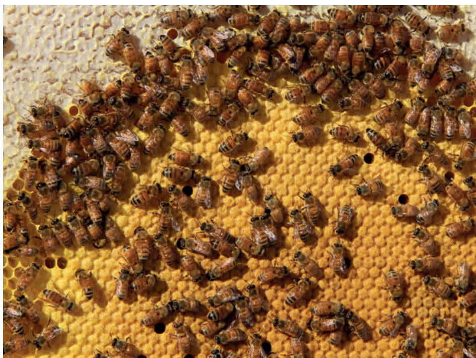
Detail from completed brood comb.

Coupled with the diverse flora of the area, each season is wildly different and presents both problems and opportunities in regards to bee management.