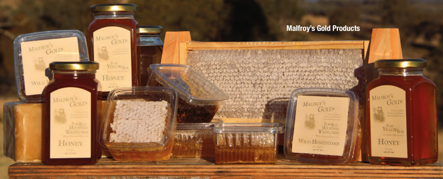
Malfroy's Gold Products